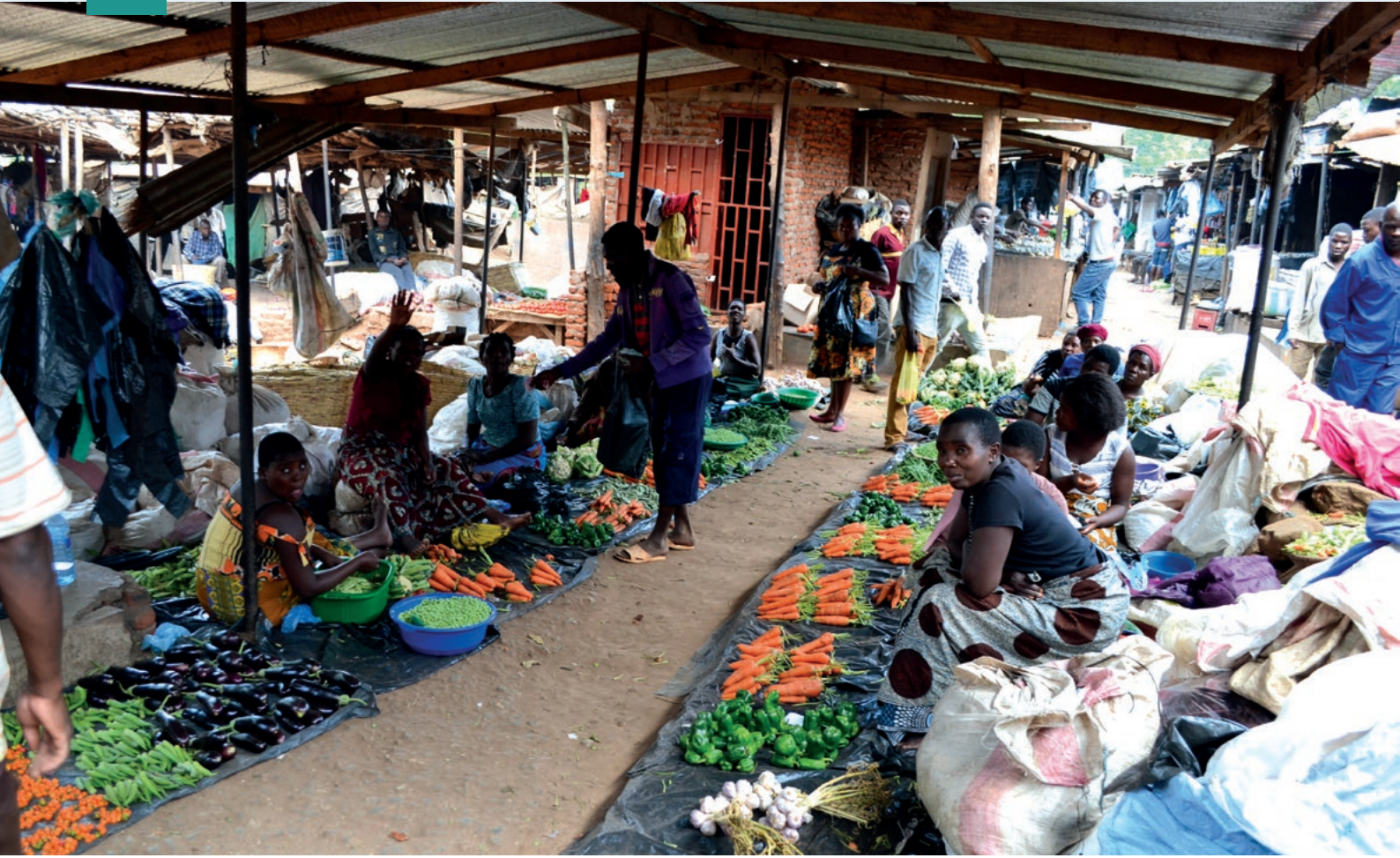
Lilongwe, Malawi. The Tsoka (top) and Lizulu (bottom) markets, located on opposite sides of the Lilongwe River, served as pilot sites for waste management initiatives within an informal government structure.