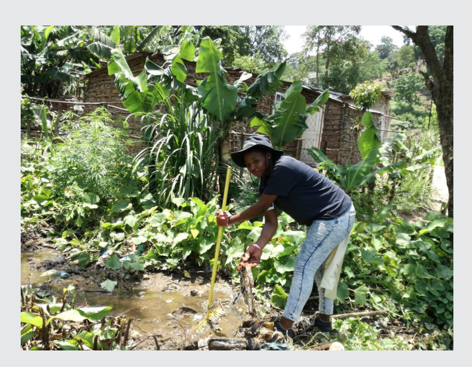
Field worker, Aller River

C40. 2017. C40: 100 Resilient Cities Pilot Project: Community Based Interventions to Improve River Heal. [online] Available at: http://www.c40.org/case_studies/community-based-interventions-to-improve-river-health [Accessed 28 Mar. 2018].