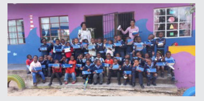
Community school children