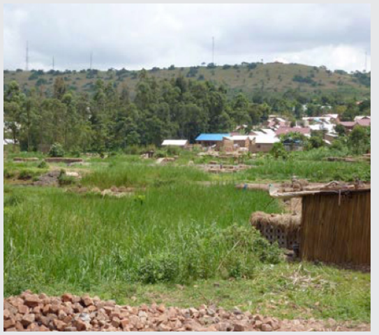
Open areas and wetlands

Sliuzas, (2012) in Sliuzas & Kehew, 2013.