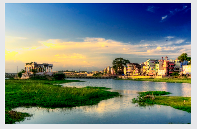
Vaigai River in Madurai, India

Earth Celebrations & DHAN Foundation. [2015]. Vaigai River Restoration Pageant Project Madurai, Tamil Nadu, South India. [Online]. Available: https://www.indiegogo.com/projects/vaigai-river-restoration-pageant-project #/. [07August 2017].