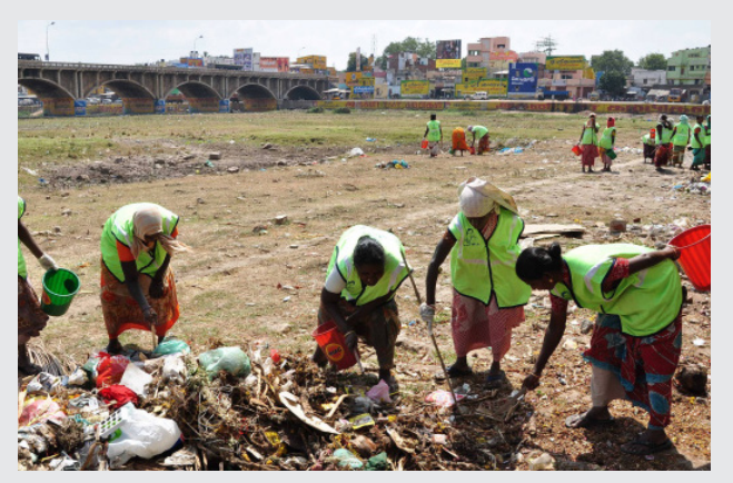
Filed workers clean up Vaigai River

https://www.indiegogo.com/projects/vaigai-riverrestoration-pageant-project#/