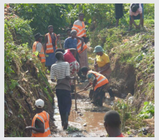
Maintenance of drains

Sliuzas, R. & Kehew, R. 2013. Integrated Flood Management Kampala . [Online]. Available: http://uni. unhabitat.org/wp-content/uploads/sites/7/2015/03/ifm-kampala-policy-brief-final.pdf. [06 August 2017].