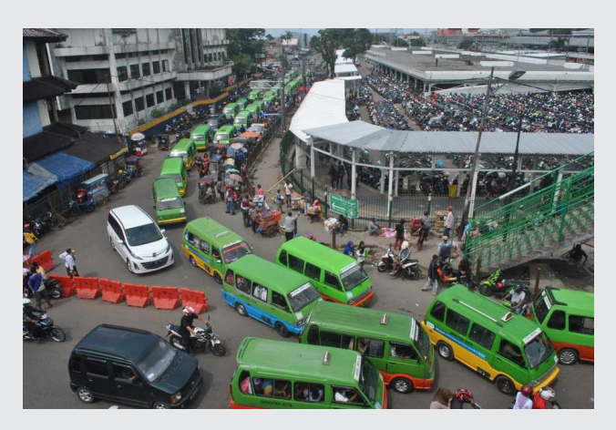
Bogor 'angkot' is the main public transport mode

ICLEI. 2011. Bogor, Indonesia. Using local initiative and knowledge for local water and soil conservation. ICLEI Case Study 129. Available: www.iclei.org/casestudies [08 August 2017].