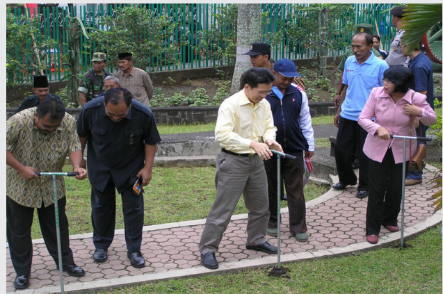
Bio pore absorbing hole

http://jakartaglobe.id/environment/bogor-winswwfs-lovable-city-title/