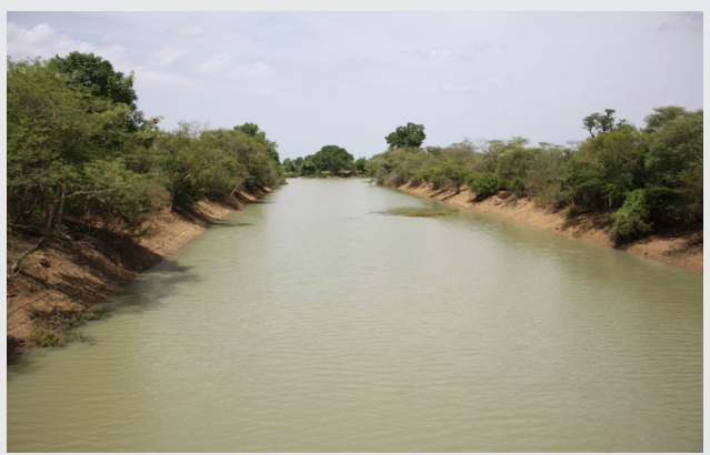
Pangani River Basin