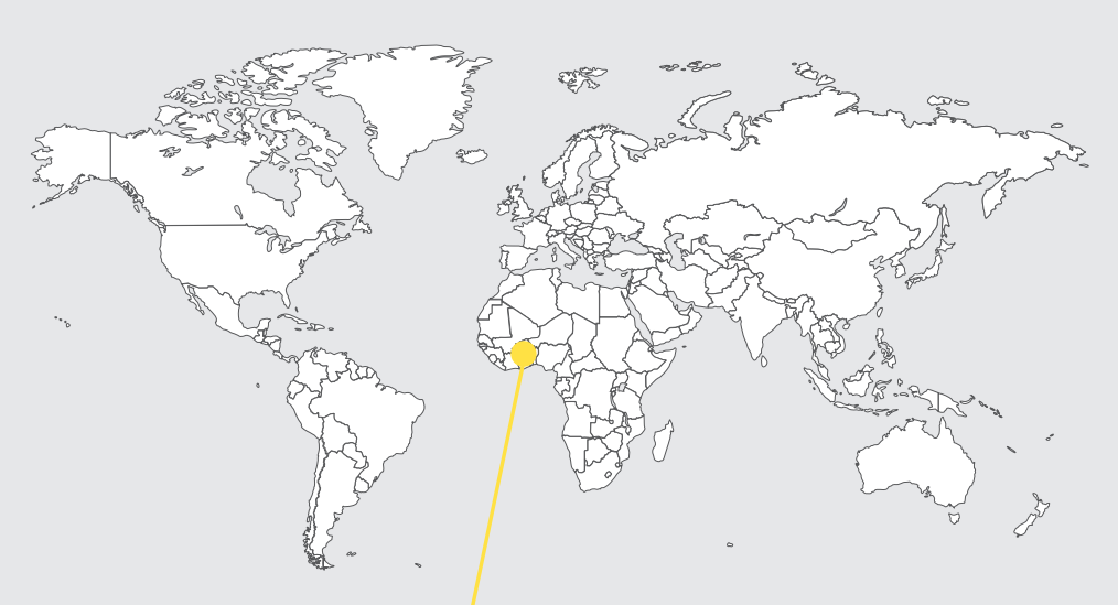
Ghana and Burkina Faso

Volta River Basin, Ghana and Burkina Faso.