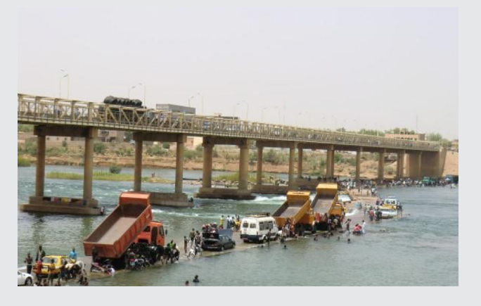
Road way on river

Unknown. 2013. Senegal – Establishing a Transboundary Organisation for IWRM in the Senegal River Basin. Case #45.[Online]. Available: http://www.gwp.org/globalassets/global/toolbox/case-studies/africa/ transboundary.-establishing-a-transboundary-organisation-for-iwrm-in-the-senegal-river-basin-45.pdf [27 August 2017].