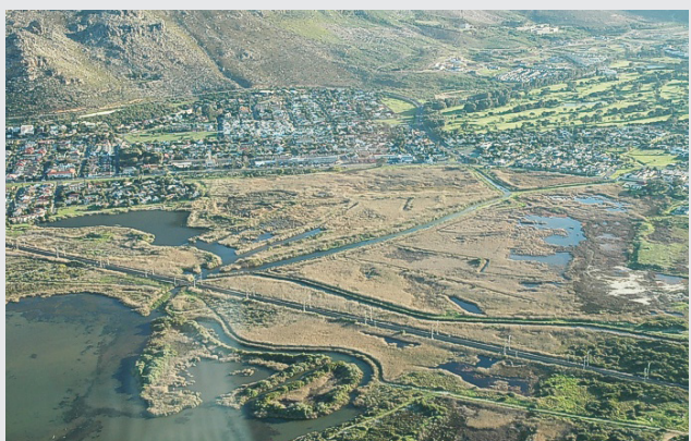
Zandvlei Estuary Nature Reserve