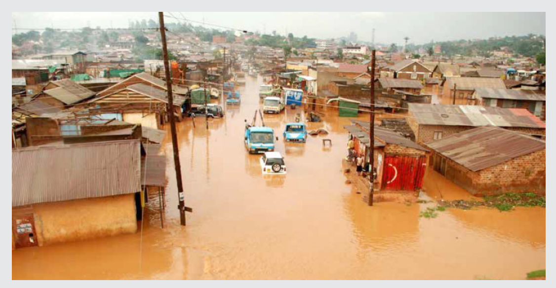
Flood waters damage properties