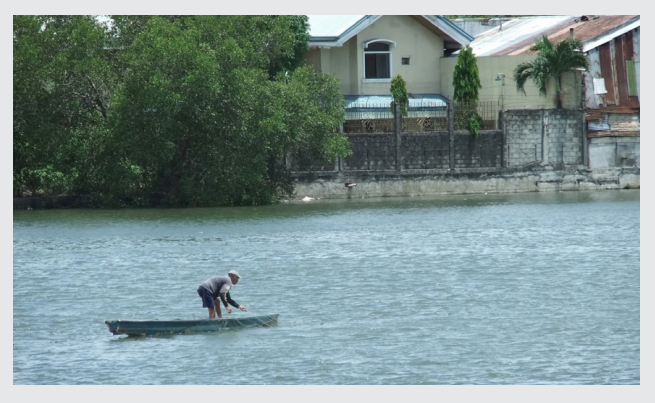
Non-destructive fishing gears used in the river.

City Environment and Natural Resources Office, lloilo City 2011, http://archive.iclei.org/documents/ Global/case_studies/CaseStudy_134-lloilo_ final20110418.pdf