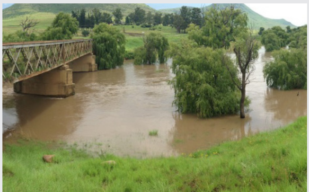
Bridge over uMzimvubu Catchment

https://umzimvubu.org/about/#jp-carousel-34