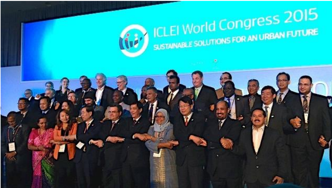
On 10 April 2015, 36 Mayors announce intent to comply with the Compact of Mayors.