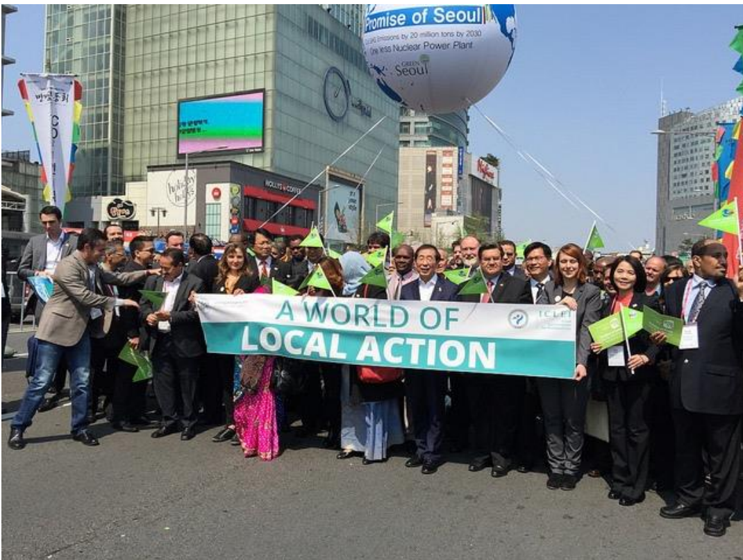
On 10 April 2015, ICLEI President and Seoul Mayor Park Won Soon led the march for sustainability in the streets of Seoul.