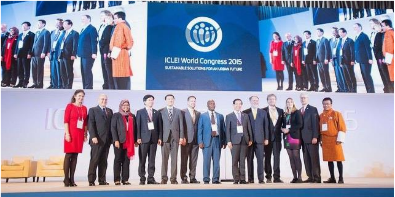
ICLEI's Global Executive Committee 2015 -2018 was inaugurated on 8 April 2015.

You are free to use and download all our photos on www.flickr.com/icleiglobal . Please credit ICLEI e.V. 2015.