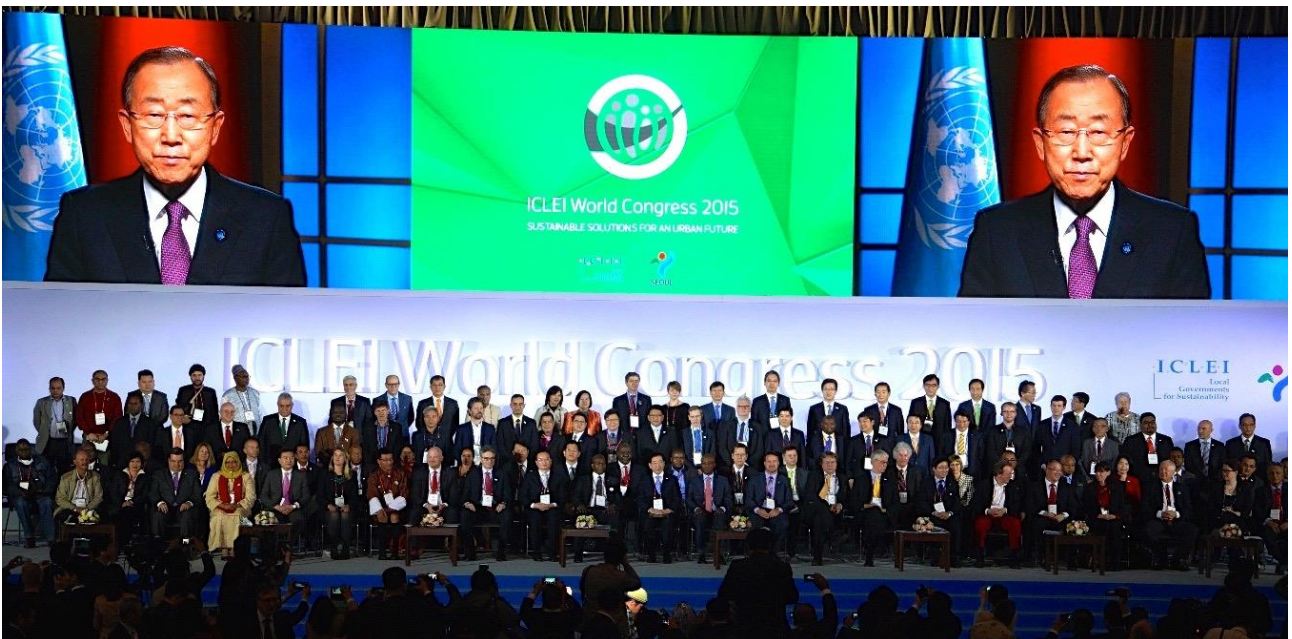
100 Mayors on the ICLEI World Congress 2015 stage adopt the Seoul Declaration entitled, "Building a world of local action for a sustainable urban future".